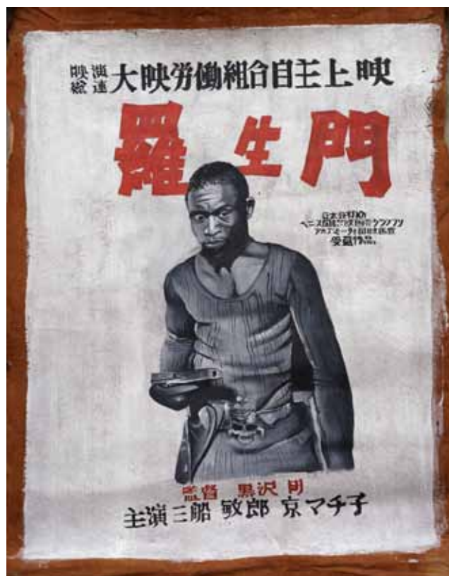
Louis-Cyprien Rials and Ramon Film Productions, untitled, 2018, painting on wood. Courtesy of the artist. Photo : Louis-Cyprien Rials

(1) Extract from Louis Cyprien Rials and Ramon Film Productions' film.