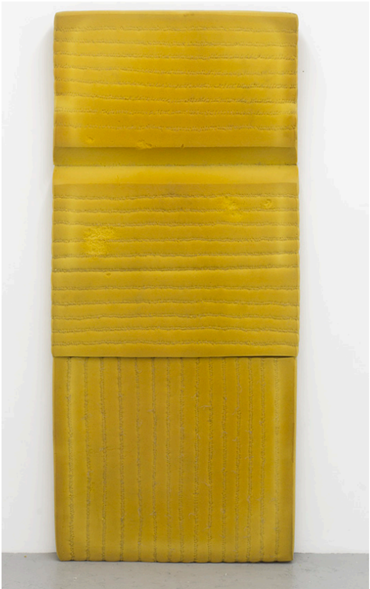
Bronwyn Katz, Erf, 2016, Mattress, wire, 194 x 88 x 14 cm, © Bronwyn Katz, Courtesy the artist and Palais de Tokyo